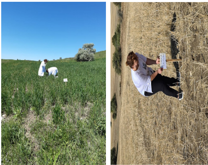
Note: Piping phase 06.07. 2020